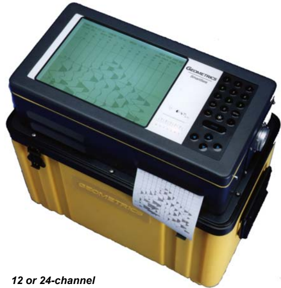
12 or 24-channel exploration seismograph

Looking for a quick way to find depth to bedrock? Trying to determine whether to blast before using earth-moving equipment? Looking for the best place to position a water well? Need a rugged instrument where a laptop just won't do?